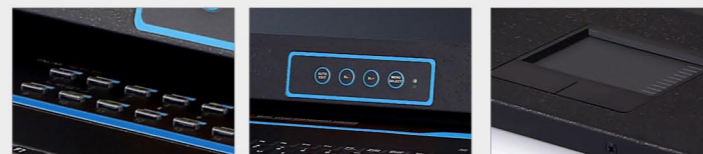
front panel push button OSD menu touchpad